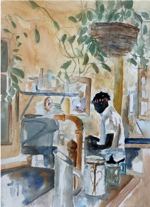
Give Us This Day , Watercolor by Roseann Egidio