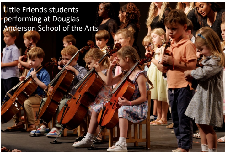
Little Friends students performing at Douglas Anderson School of the Arts