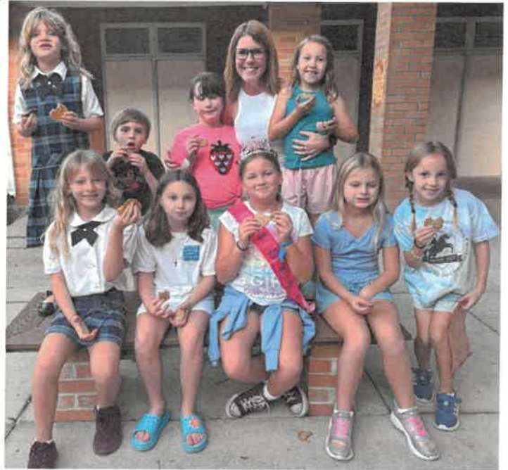
The kids learned about being the salt of the earth & then drew worlds with glue & covered them with salt.