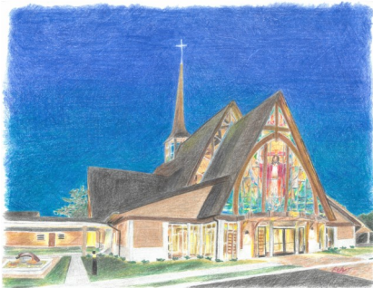
Drawing by Echo Saunders #HABOnTheMap